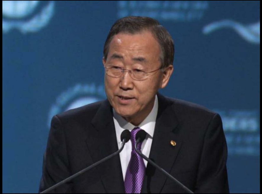
Ban ki-moon opens the Summit