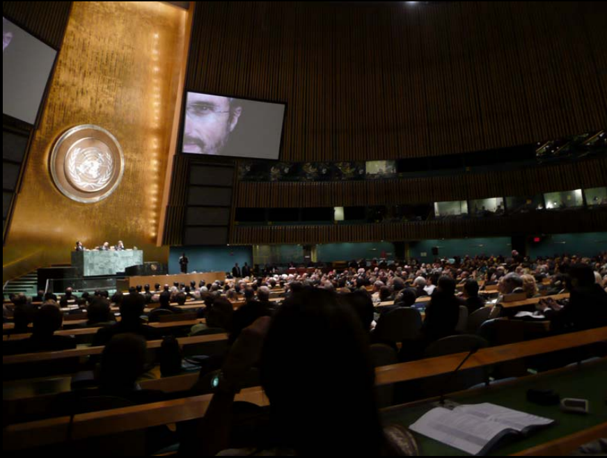
Welcome Reception at UN headquarters