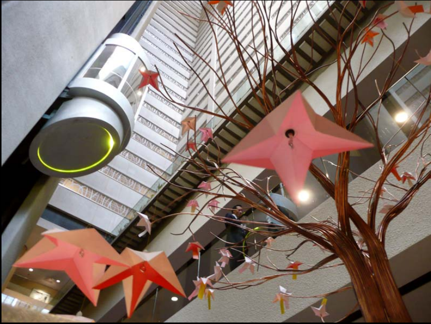
The "Tree of Promises"