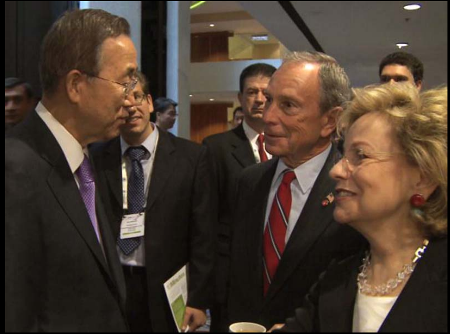
UN Secretary-General Ban Ki-moon and New York City Mayor Michael Bloomberg