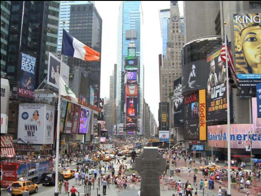
Location of the summit: Marriott Marquis near Times Square